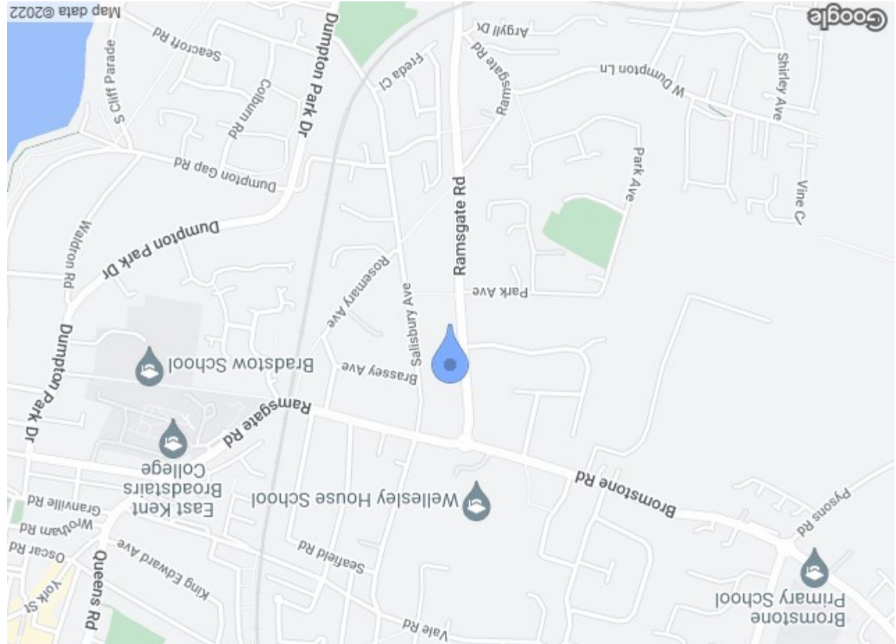
RAMSGATE ROAD BROADSTAIRS